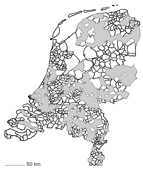
Figure 1: Distribution of the municipalities of the NLCS study population over the Netherlands

Motorised traffic emissions result in small-scale spatial variations (high concentrations at short distances from major roads) and affect urban and regional background air pollution concentrations. We quantified small-scale spatial variations in air pollution concentrations by calculating proximity to major roads. For urban and regional background concentration, we used concentration data for the pollutants black smoke and nitrogen dioxide, both of which are indicators of traffic-related air pollution. Exposure to traffic-related air pollution has been characterised by estimating long-term average ambient air pollution concentrations at the 1986 home address. Details of the exposure assessment procedures have been described previously.14 Briefly, the addresses were geocoded with a geographic information system. Long-term average exposure to outdoor air pollution was calculated as a function of the regional background pollution, pollution from urban sources (urban background), and pollution from local sources (nearby streets).